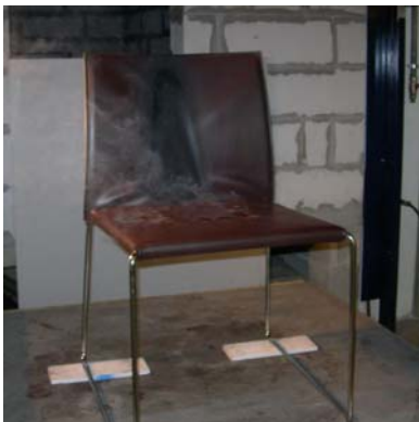
Just after the burner application