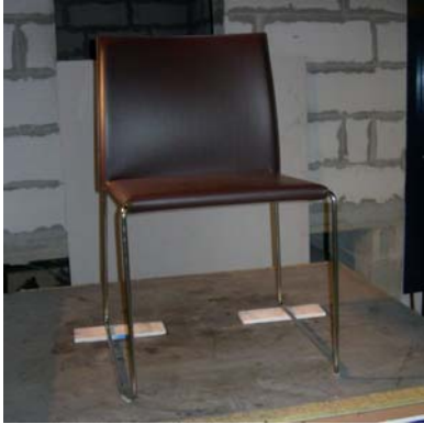
Before the test