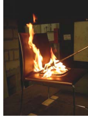
During burner application