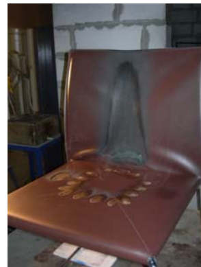
End of test